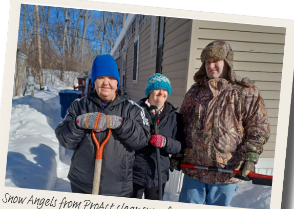
Snow Angels from ProAct clear snow for an older homeowner

"DARTS has been very helpful with yard work we can't do ourselves. It makes us feel like better neighbors. Thanks so much!"