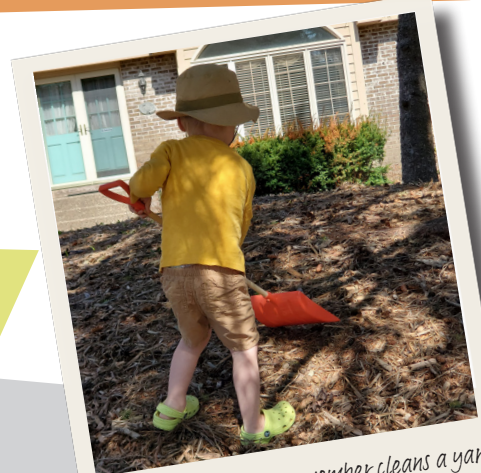
Chimney Doctors team member cleans a yard

"DARTS, you have been so wonderful... truly I couldn't live in my own home (for 45 years now) without help and without all of you. Thank You."