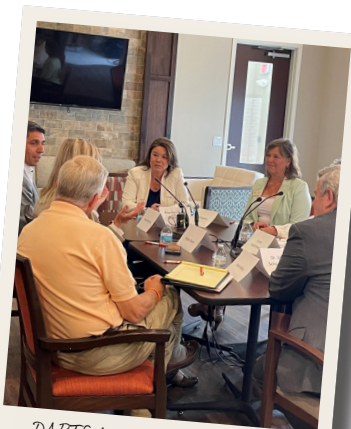
DARTS Ann at drug & insulin roundtable discussion

7.3% of Dakota County are Hispanic/Latine -Data USA