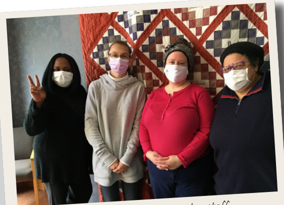
DARTS Chamille & Homemaker staff

"All of the personnel assigned to the household repair and outdoor chores were excellent! You offer a very valuable service to all."