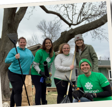
Securian yard cleanup team

When community inputs highlight needs, we are finding community partners to fill gaps such as providing transportation for Farmington.