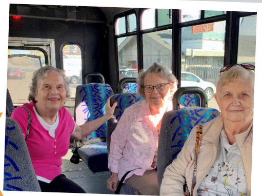
LOOP riders chatting

77% of adults 50 and older want to remain in their homes for the long term. -AARP, 2021