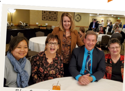
Blue Cross Blue Shield of Minnesota at Party It Forward 2022

SPIRE Credit Union The Quill - Hastings Waterous Company