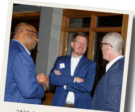
2022 Annual Breakfast attendees