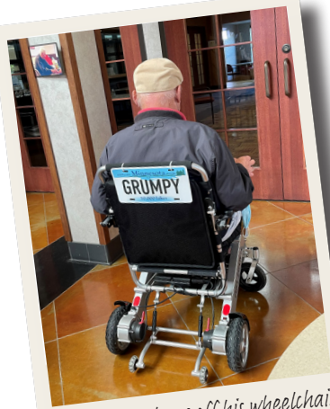
LOOP rider shows off his wheelchair