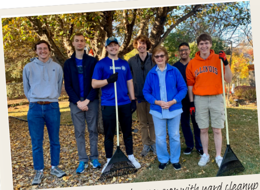
Allianz team helps Eagan homeowner with yard cleanup