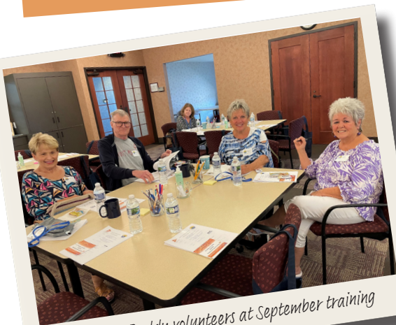
Learning Buddy volunteers at September training

"These students are our future leaders. We are preparing them. They raise my energy level!"